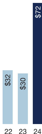
NET INCOME* ($MM)