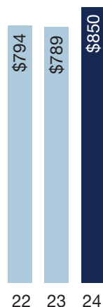
STOCKHOLDERS' EQUITY* ($MM)