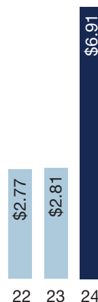
BASIC EARNINGS PER SHARE* ($)