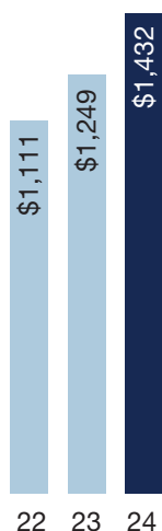
GROSS REVENUE ($MM)