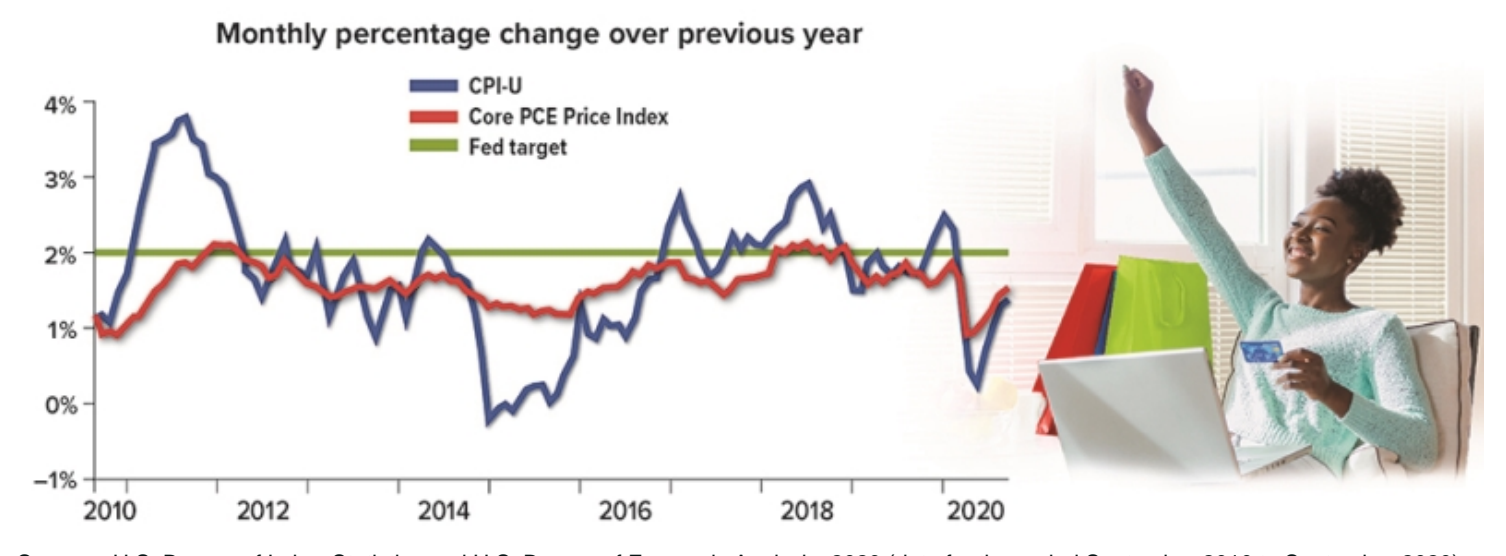
Sources: U.S. Bureau of Labor Statistics and U.S. Bureau of Economic Analysis, 2020 (data for the period September 2010 to September 2020)

The inflation measure most often mentioned in the media is the Consumer Price Index for All Urban Consumers (CPI-U), which tracks the average change in prices paid by consumers over time for a fixed basket of goods and services. In setting economic policy, however, the Federal Reserve Open Market Committee focuses on a different measure of inflation — the Personal Consumption Expenditures (PCE) Price Index, which is based on a broader range of expenditures and reflects changes in consumer choices. More specifically, the Fed focuses on "core PCE," which strips out volatile food and energy categories that are less likely to respond to monetary policy. Over the last 10 years, core PCE prices have generally run below the Fed's 2% inflation target.