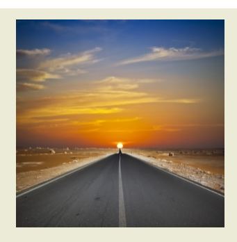
No investment strategy can guarantee success. All investing involves risk, including the possible loss of your contribution dollars.

There is no assurance that working with a financial professional will result in investment success.