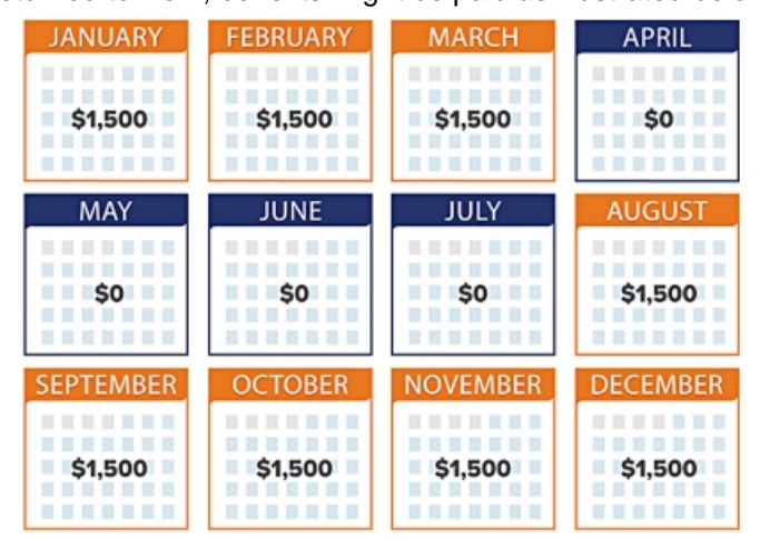
In practice, benefits may be withheld earlier in the year or retroactively, depending on when the SSA becomes aware of earnings.

In this hypothetical example, Fred claimed Social Security in 2021 at age 62, and he was entitled to a $1,500 monthly benefit as of January 2022. Fred returned to work in April 2022 and is on track to earn $31,560 for the year — $12,000 above the $19,560 RET exempt amount. Thus, $6,000 ($1 for every $2 above the exempt amount) in benefits will be deducted. Assuming that the Social Security Administration (SSA) became aware of Fred's expected earnings before he returned to work, benefits might be paid as illustrated below.